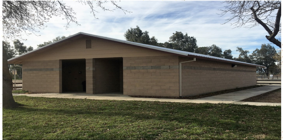
Rolling Hills Casino Equestrian Center Restroom Construction