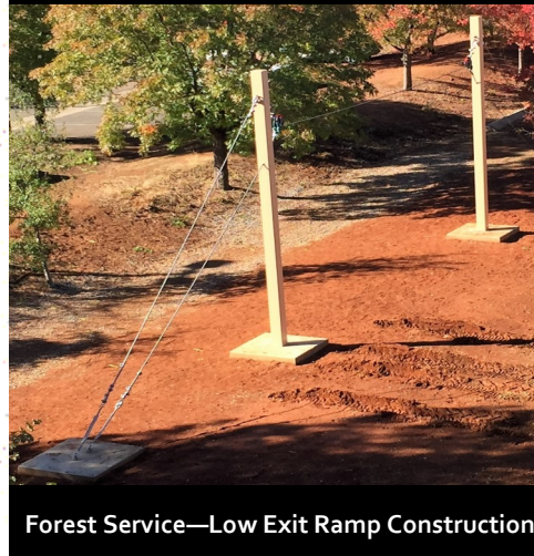
Forest Service—Low Exit Ramp Construction