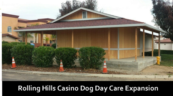
Rolling Hills Casino Dog Day Care Expansion