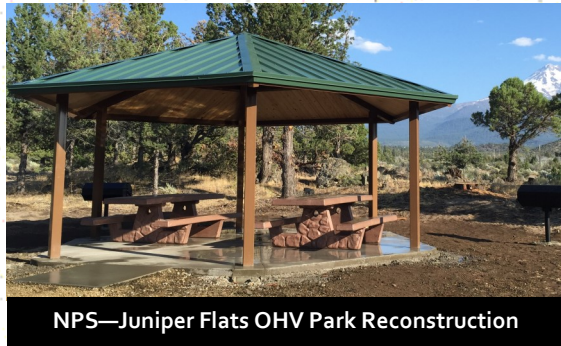
NPS—Juniper Flats OHV Park Reconstruction