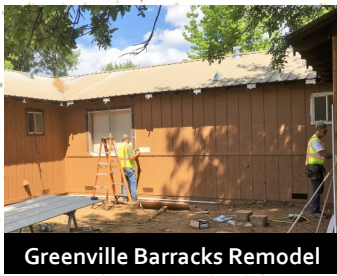
Greenville Barracks Remodel