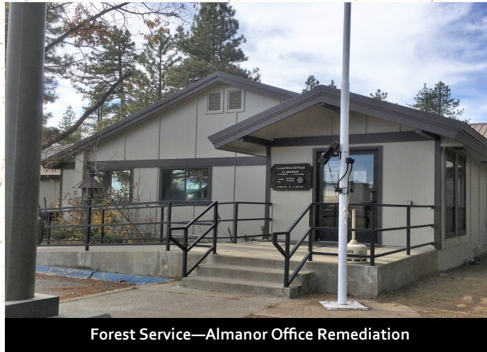
Forest Service—Almanor Office Remediation