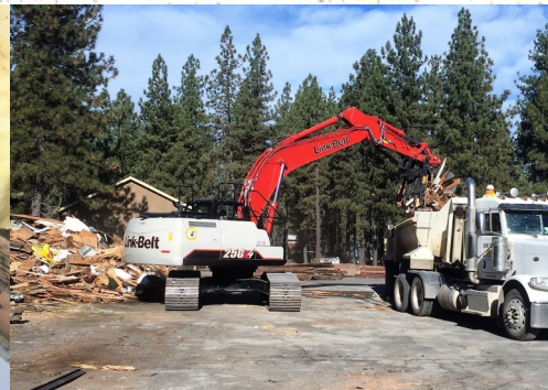
Building Demolition & Removal