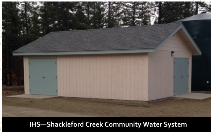
IHS—Shackleford Creek Community Water System