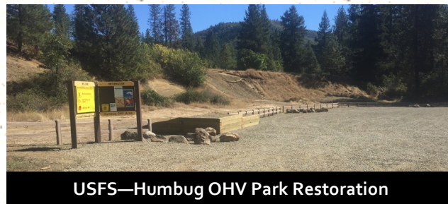
USFS—Humbug OHV Park Restoration