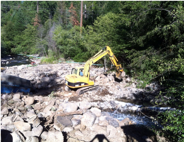
Olsen Hydroelectric Power Plant Hydroelectric Dam Repair