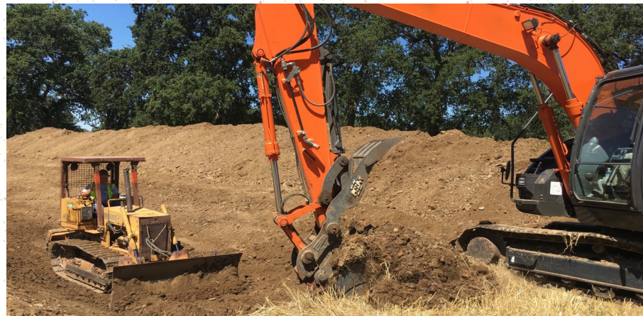
WSRCD—Millville Diversion/Clover Creek Fisheries Restoration Project