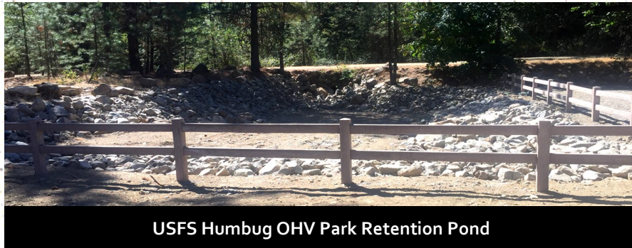
USFS Humbug OHV Park Retention Pond