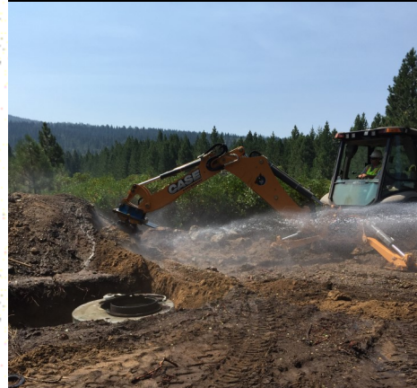
NPS—Manzanita Lake Sewer Replacement