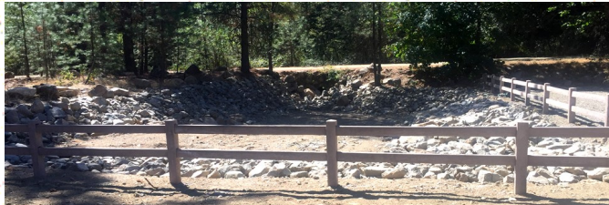
USFS Humbug OHV Park Retention Pond