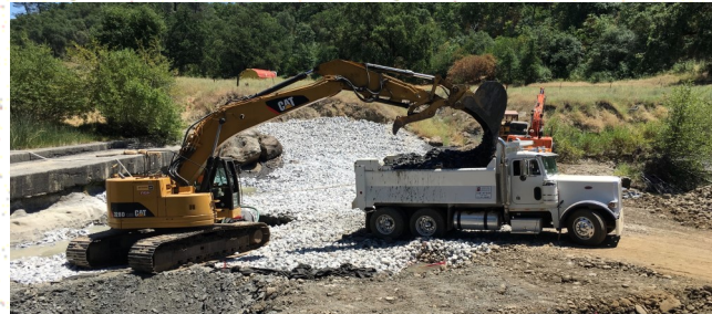
Millville Diversion/Clover Creek Fisheries Restoration