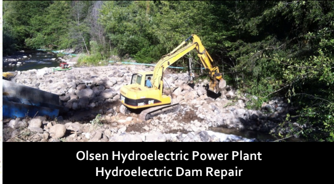
Olsen Hydroelectric Power Plant Hydroelectric Dam Repair