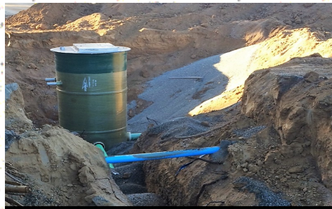
Rolling Hills Casino Sewer Lift Station