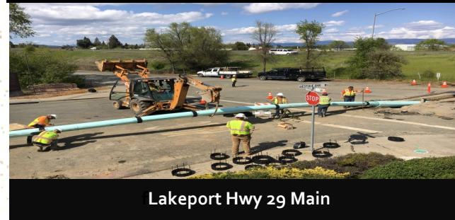
Lakeport Hwy 29 Main