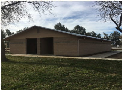
Rolling Hills Equestrian Restroom & Sewer Project/Lifts Station