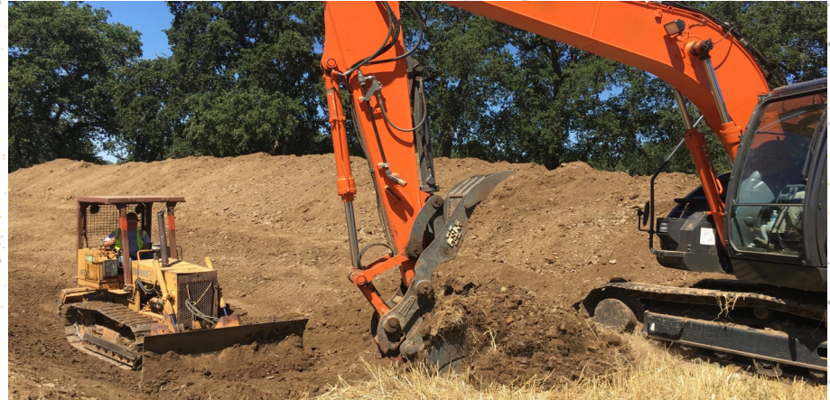
WSRCD—Millville Diversion/Clover Creek Fisheries Restoration Project