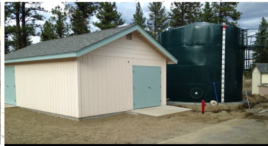
IHS—Shackleford Comm. Water System